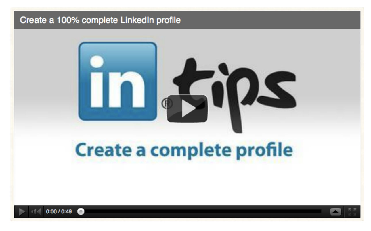
Share this short video to help your staff learn more.

In some cases you might be the only one running the organization, in that case you can skip this section. However, in all other cases other people are involved, staff, board members, volunteers etc. Ask those people that are part of the organization to complete their profiles as well. The more staff members are on LinkedIn the more likely it is, your organization will come into contact with people vital for your organizations development.